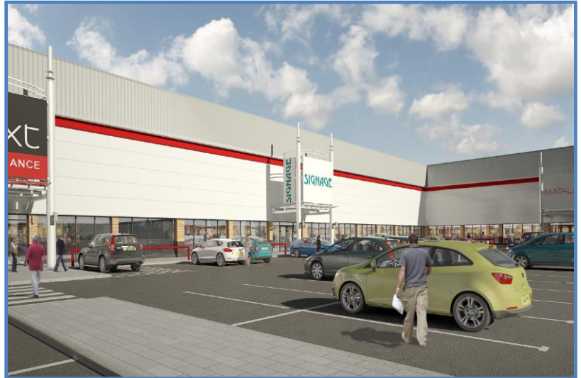
Proposed Refurbishment – For Illustrative Purpose Only